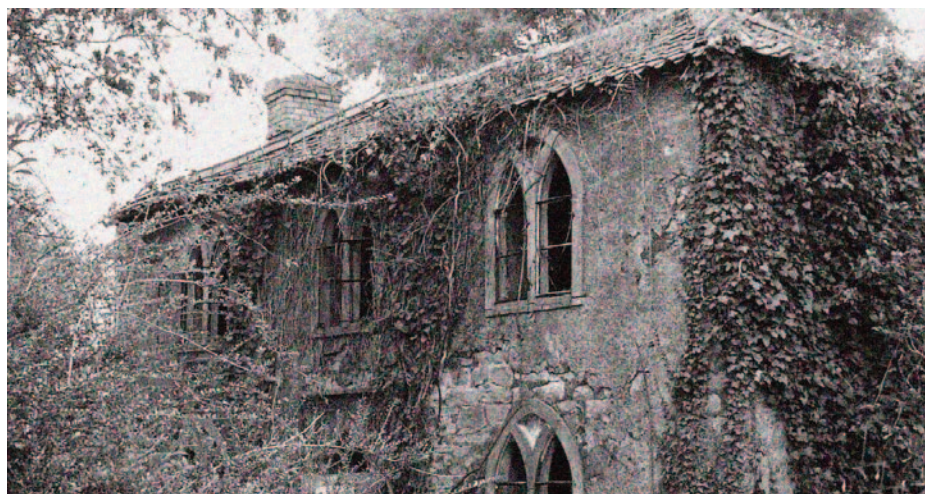
A chapel near the Bailys building which disappeared in a less enlightened age when lower value was placed on old buildings